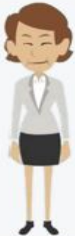
RSPP E MEDICO COMPETENTE