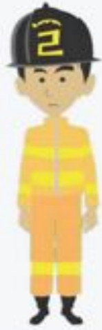
ORGANISMI DI VIGILANZA E SOCCORSO