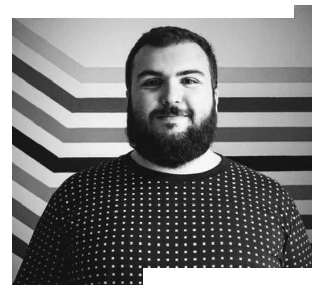
Marco D'Angelo / PROJECTMII