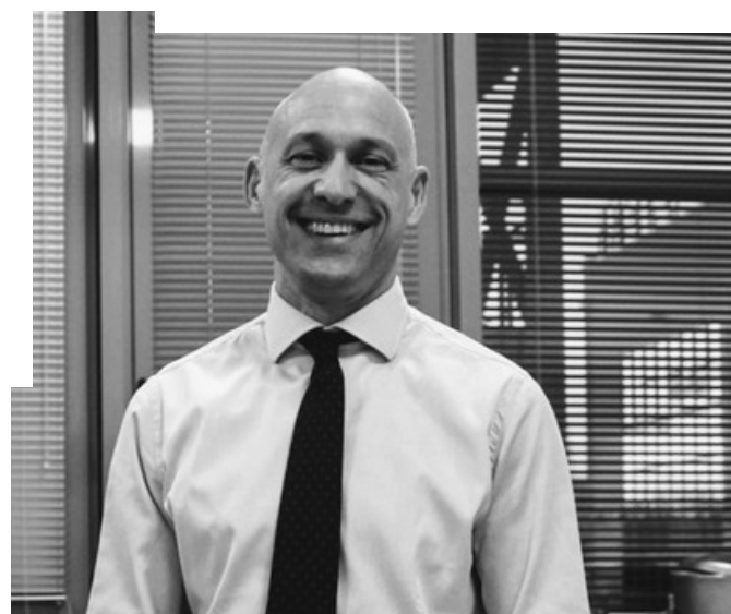
Massimo Ambanelli / HI FOOD