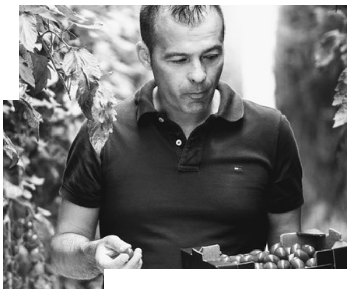
Luigi Galimberti / SFERA